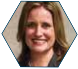
Marni Brook Women's Economic Ventures