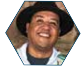
Cesar Hernandez Center for Community Change