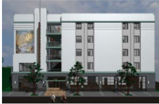
Central Terrace, Oxnard Many Mansions $1 million