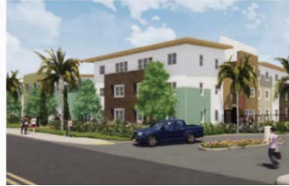
Cypress Place at Garden City, Oxnard People's Self-Help Housing $850,000